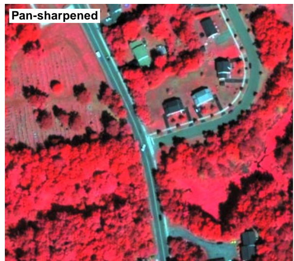
Summary of Multiresolution Fusion Inputs, Products, and Methods