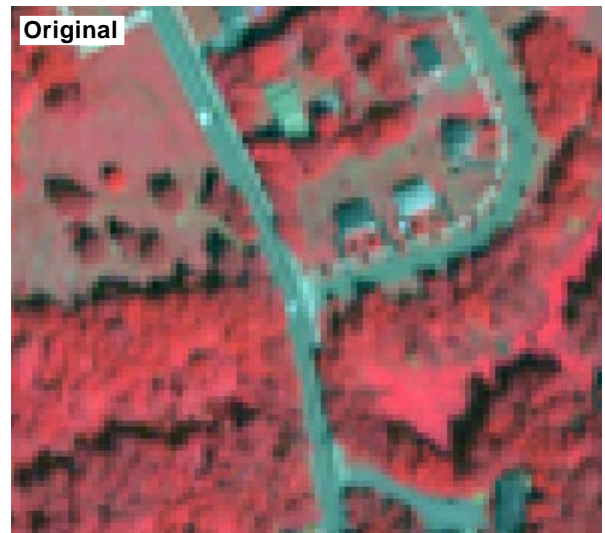
Color-infrared combination of image bands from a small portion of a QuickBird scene of an area in Vermont. Above, display of original bands (2.4-meter cell size). Below, same band set after pan-sharpening to 0.6-meter cell size reveals significantly more spatial detail.

Several color fusion methods are available in the Multiresolution Fusion process. Results from the Paris and Brovey methods are compared in the TechGuide entitled Multiresolution Fusion: Comparison of Pan-Sharpening Methods .